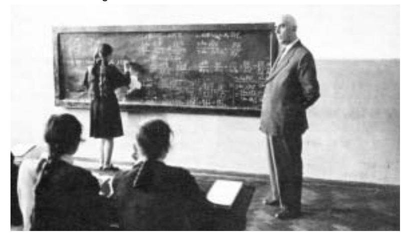
by Erich Lessing from The Family of Man. reprinted by permission of Magnum Photos

I did this same activity with both my intermediate level classes. I then skimmed through all the writings from each class to see how they compared with each other. In both classes, I found that many students wrote about the same particular picture—the one with the strict-looking teacher at the board with a nervous-looking student.